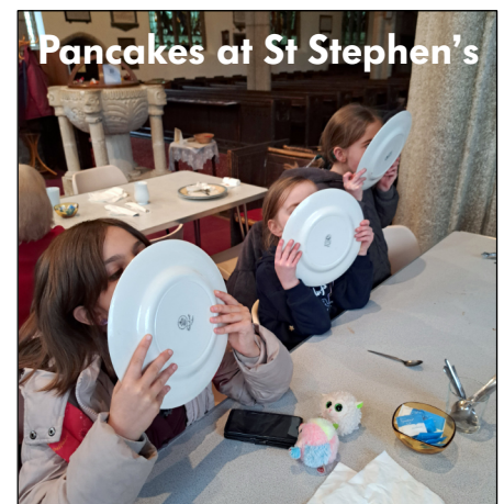
Pancakes at St Stephen's