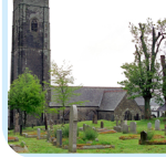
St Michael Landrake