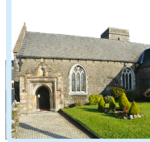
SS Nicholas & Faith, Saltash