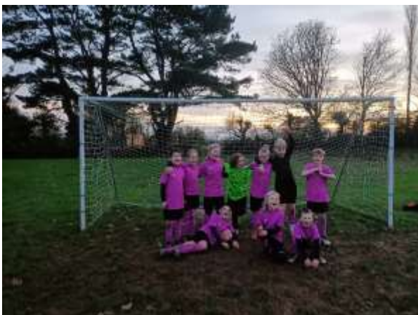
Year 3-4 Football team