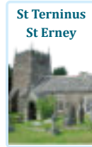
St Terninus St Erney