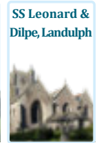
SS Leonard & Dilpe, Landulph

Love God, Serve People, Make Disciples. www.saltashteamministry.org