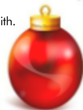
Bottom right: Christmas Tree Festival.