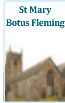
St Mary Botus Fleming