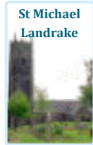
St Michael Landrake