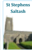
St Stephens Saltash