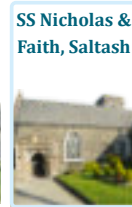
SS Nicholas & Faith, Saltash