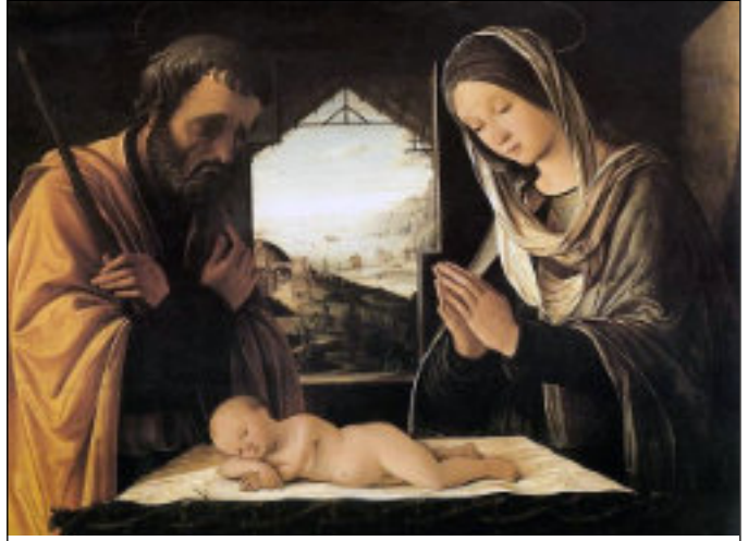
Lorenzo Costa, Nativity (1490)

Many years ago, I received a Christmas card which had the depiction of the Nativity scene on its front. In the manger was the baby Jesus, Mary lovingly looking at him, Joseph protectively standing over them, the Shepherds gathered by the entrance. (No kings, of course, because they do not arrive until Epiphany.) Beyond the open door there was a figure approaching carrying a large cross. The Shepherd nearest the door is