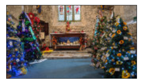
See page 5 for more details.

Christmas Concert with Tamar Valley Male Voice Choir St Stephen's Church Fri 3 December, 7.30pm