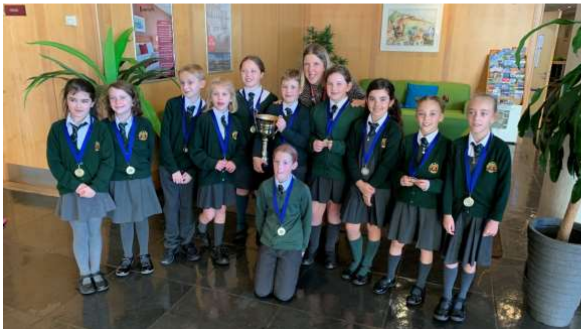
AAA County Championships Girls A and B teams

This morning 11 children from Key stage 2 travelled to the Future Inn to compete in the Plymouth Speech and drama festival. They performed their poems together beautifully and achieved an exceptionally high mark of 89 out of 90. Well done to all the children involved!