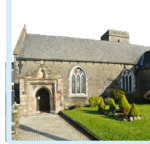
SS Nicholas & Faith, Saltash