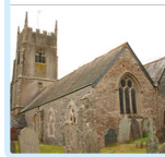
St Mary Botus Fleming