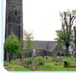
St Michael Landrake