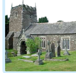
St Terninus St Erney